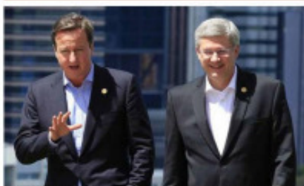
David Cameron with the Canadian prime minister, Stephen Harper.

Press Association guardian.co.uk, Sunday 30 October 2011 10:44 GMT