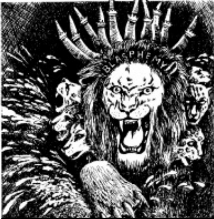
The 7 headed 10 horned beast

of them, the first beast rises up out of the sea. This beast is the main subject of the prophecy. He has seven heads and ten horns and while he has the body of a leopard, he has the feet of a bear and the mouth of a lion. On his head there is written the name of blasphemy. This beast receives a deadly wound which is healed and he makes war against God's people for forty-two months. All who live on earth worship and praise him.