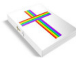
Homosexuality in The Bible

Homosexuality was first mentioned in the Bible in 1940 in the Revised Standard Version. There is no mention of or reference to homosexuality in any Bible prior to this - only interpretations have been made. All LGBT Bible interpretations commonly cite only eight verses in the Bible that they interpret to mean homosexuality is a sin. Eight verses in a book of thousands!