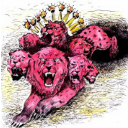
The Beast ascends from the Pit

In Revelation 9:1,2 terrible creatures with the power to torment humanity are said to arise from this pit. In Revelation 20:1,2, Satan is said to be bound in this pit for a thousand years.