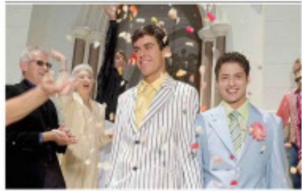
Denmark has been a pioneer in gay rights since 1989 when it became the first country in the world to offer civil unions for gay couples.

Homosexual couples in Denmark have won the right to get married in any church they choose, even though nearly one third of the country's priests have said they will refuse to carry out the ceremonies.