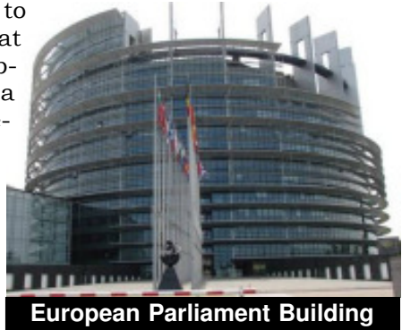
European Parliament Building

The European Parliament building has been also designed along the same lines as the tower of Babel. Here we see a photograph of the building. It is easy to see the intention behind the design. This is another uncanny example of the link between Europe and the Beast power of Revelation.