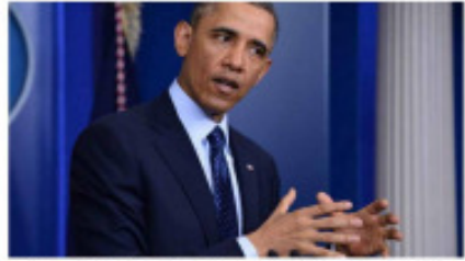
President Barack Obama answers a question about his position on the White House's new pledge on March 11, 2013 following a meeting with US Speaker of the House John Boehner and Congressional leaders.